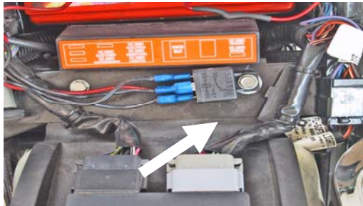
Twin Cam 88