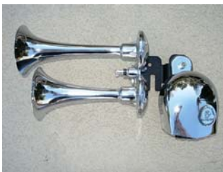
Trumpets and horn cover (with hanging strap) attached to bracket.

-A good quality wax will protect your horns (chrome) from the elements.